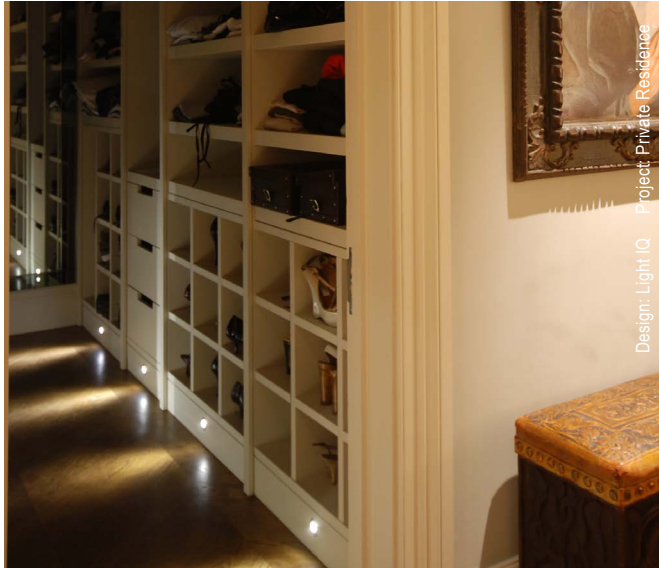
Design: Light IQ. Project: Private Residence